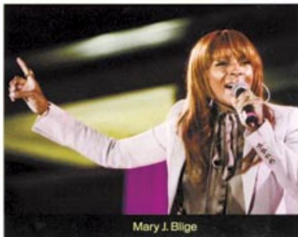
Mary J. Blige