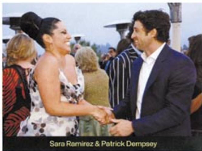
Sara Ramirez & Patrick Dempsey

At the Butterfly Ball, stars saluted Chrysalis, which works to eradicate homelessness by providing employment opportunities. Nothing like a job well done.